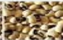
Black Eye Beans