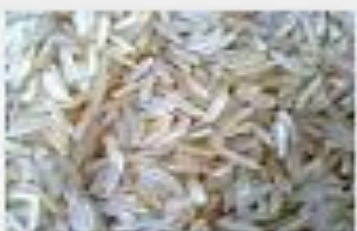
1121 Golden Sella Basmati Rice