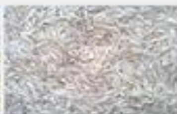
Pusa Raw Basmati Rice