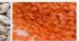
Masoor Dal (Red Lentils)