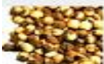
Roasted Gram Whole