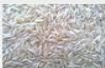
1121 Raw Basmati Rice