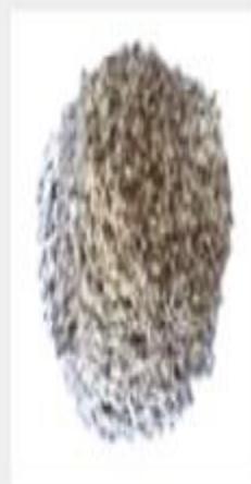
Cotton Seed Hull