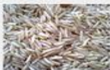
Traditional Brown Basmati Rice