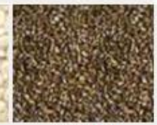
Cassia Tora Semen Seeds