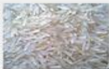
1121 Cream Sella Basmati Rice