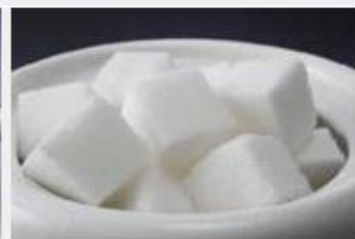
White Sugar Cubes