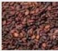
Brown Sesame Seeds