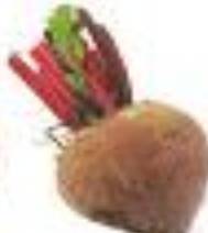
RED BEET ROOT