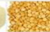
Chana Dal (Split Gram)