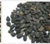
Black Sesame Seeds