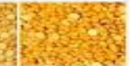
Toor Dal (Split Pigeon Peas)