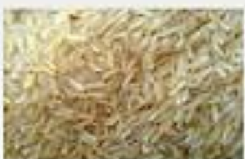
Pusa Golden Sella Basmati Rice