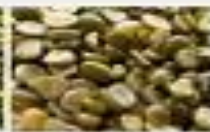
Moong Dal with Skin