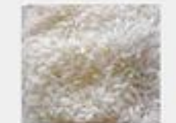
Ir 35 Rice