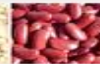
Red Kidney Beans (Rajma)