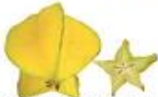
CARAMBOLA (STAR FRUIT)