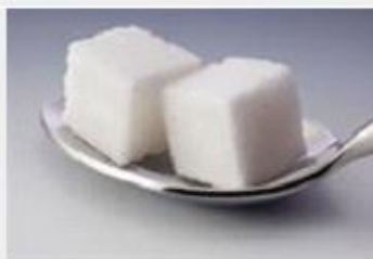
Pure White Sugar Cubes