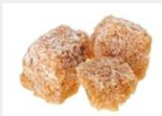
Cane Sugar Lump