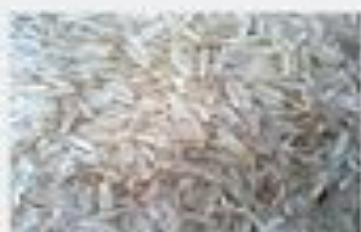
Pusa Cream Sella Basmati Rice