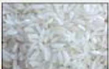
Medium Grain Rice