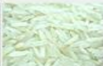
Pr 11 Raw Long Grain Rice