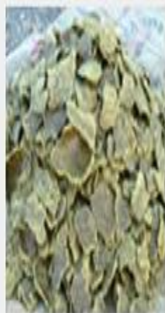
Cotton Oil Cakes