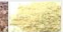
Gram Flour (Besan)