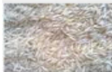
1121 Steam Basmati Rice