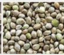
Sun Hemp Seeds