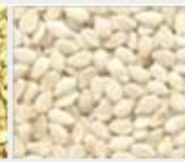
Hulled Sesame Seeds