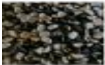
Urad Dal with Skin