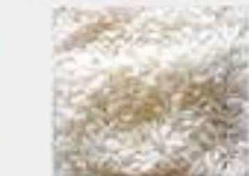
Ir 54 Rice