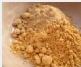
Cane Sugar Powder