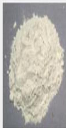
Guar Gum Powder