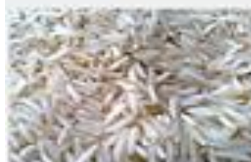
Pusa Steam Basmati Rice