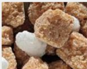
Brown Sugar Cubes