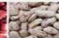
Light Kidney Beans (Rajma)