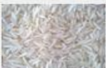
Traditional Pure Basmati Rice