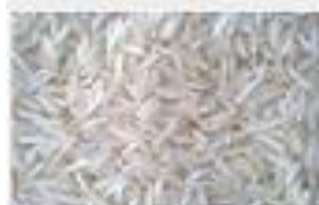
Traditional Pure Basmati Rice