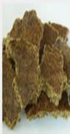
Cotton Seed Cakes