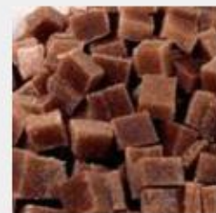
Pure Brown Sugar Cubes