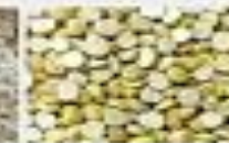
Roasted Gram Split