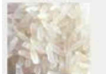
Ir 8 Rice