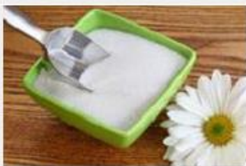
White Sugar Powder