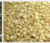
Natural Sesame Seeds