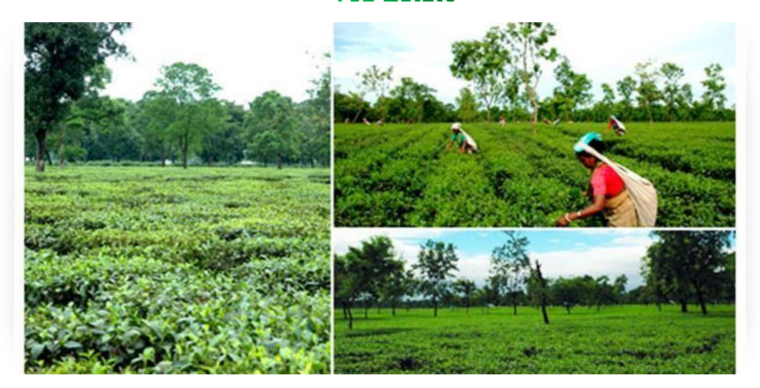
Types of Tea